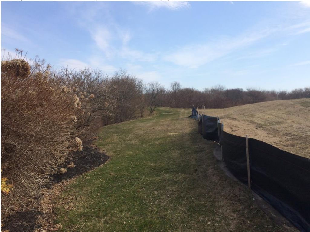
Photo 4 (04-11-17): Photo taken looking northeast in unimproved section of Lighthouse Point Road paper street. Path could readily be established in the mowed grass area between the landscaping and the black siltation fence.