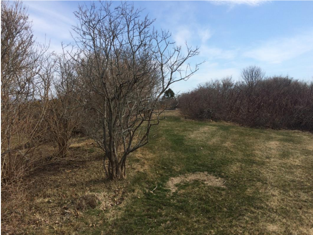
Photo 5 (04-11-17): Photo taken looking northeast near the end of the unimproved section of Lighthouse Point Road paper street.