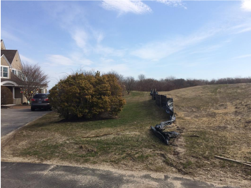
Photo 3 (04-11-17): Photo taken looking northeast at the end of the paved portion of Lighthouse Point Road paper street section. Landscape bed is within the unimproved section of the paper street and the black siltation fence is on the south side.