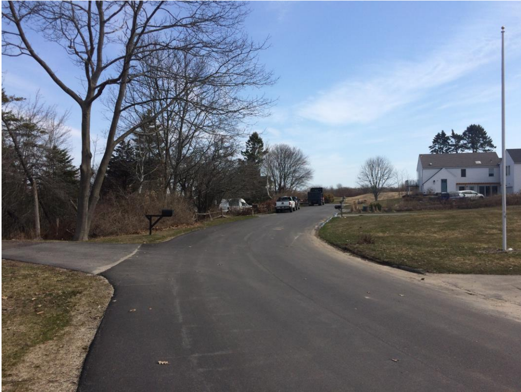
Photo 1 (04-11-17): Photo taken looking northeast from the end of the accepted portion of Lighthouse Point Road.