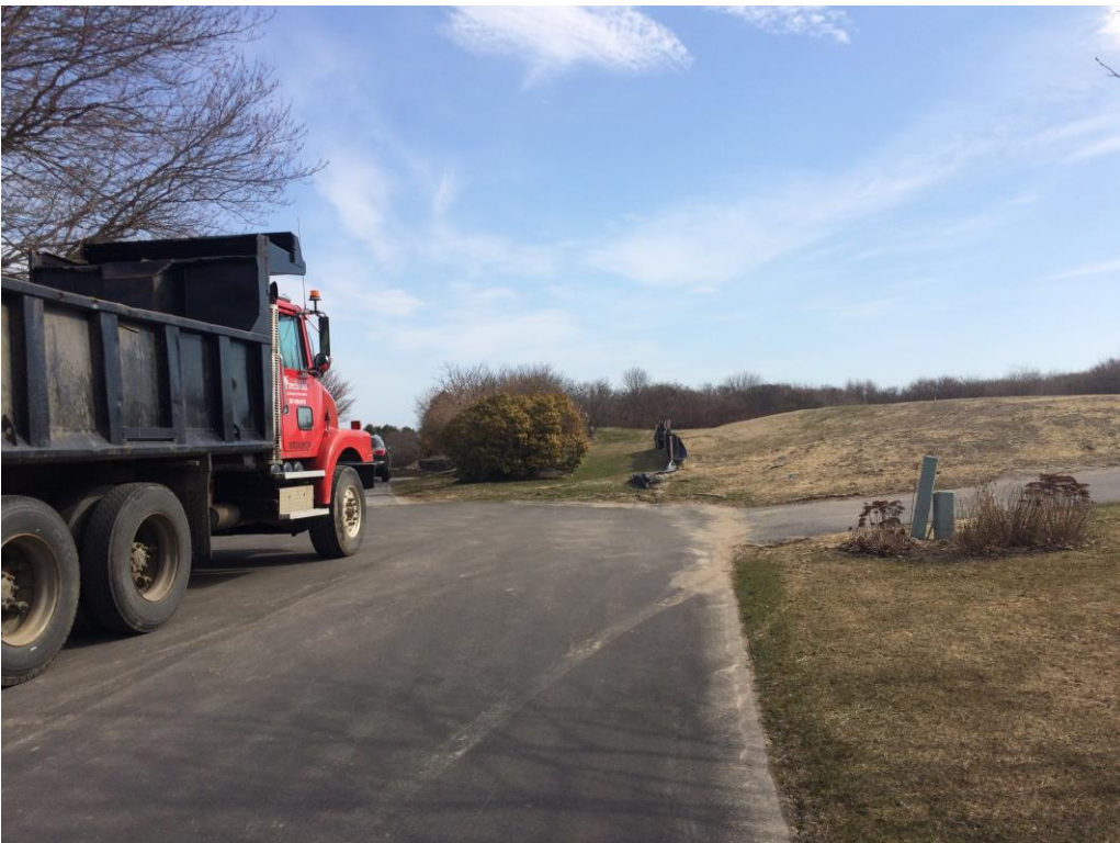
Photo 2 (04-11-17): Photo taken looking northeast from the paved portion of Lighthouse Point Road paper street section.