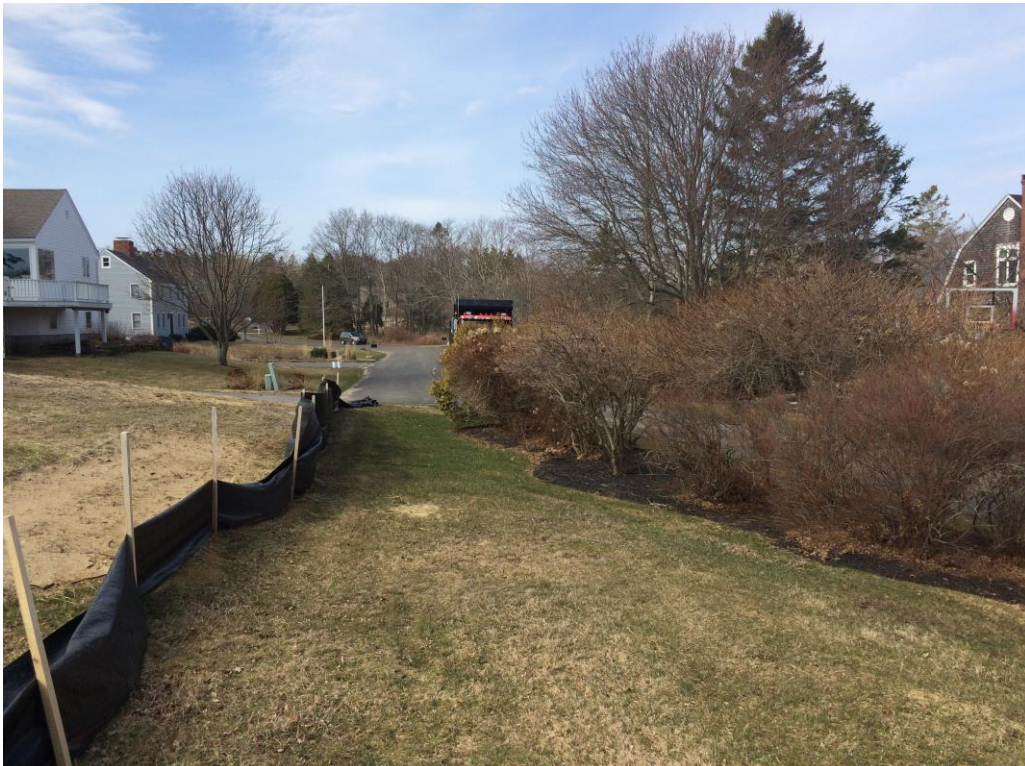
Photo 6 (04-11-17): Photo taken looking southwest near the end of the unimproved section of Lighthouse Point Road paper street. Path could readily be established in the mowed grass area between the landscaping and the black siltation fence.